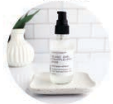
ISLAND GIRL PINEAPPLE+PAPAYA ENZYME MASK $9.00 | 2 OZ.