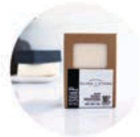
'SOPHISTICATED MAN'* (WOODS+AMBER+CITRUS)