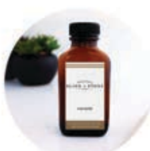
SANDALWOOD+MUSK+ ORANGE BLOSSOM*