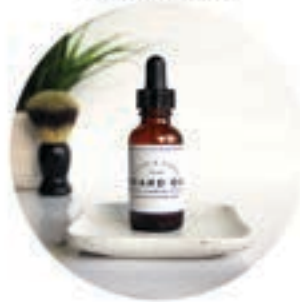
'SOPHISTICATED MAN'* (WOODS+AMBER+CITRUS)