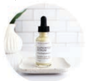
SUPERFOOD SERUM $12.00 | 1 OZ.