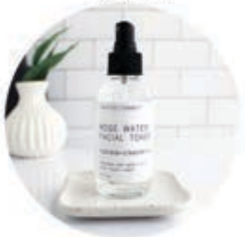
ROSE WATER FACIAL TONER $9.00* | 4 OZ.