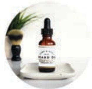
'CONFIDENT MAN'* (SANDALWOOD+MUSK+ ORANGE BLOSSOM)