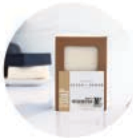
'CONFIDENT MAN'* (SANDALWOOD+MUSK+ ORANGE BLOSSOM)