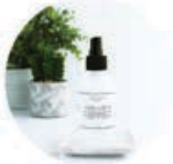
VANILLA BEAN 34111