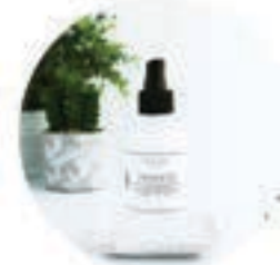
FRASER FIR HOLIDAY COLLECTION 34114