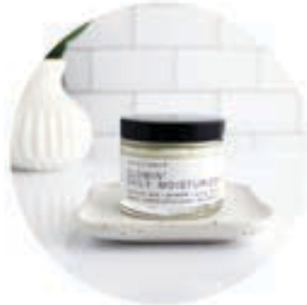
GLOWIN' DAILY MOISTURIZER $13.00 | 2 OZ.