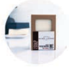
'SELF-MADE MAN' (CITRUS+CEDARWOOD)