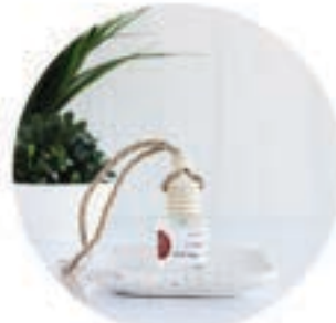
CHRISTMAS HOLIDAY COLLECTION