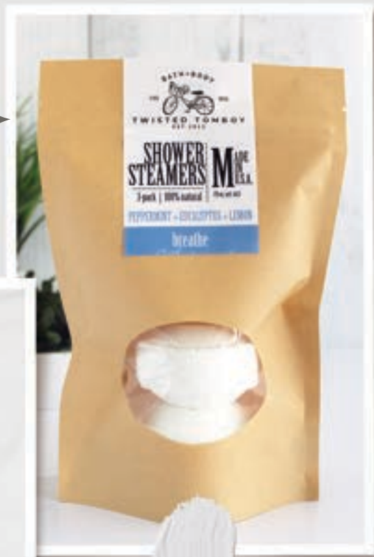
SHOWER STEAMER TABLETS

100% essential oil blend - no fillers! Spray 1-2 pumps into the steam of the shower and enjoy! (2 oz.)