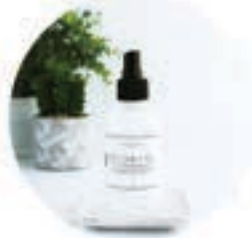
WHITE OAK+VANILLA 34113