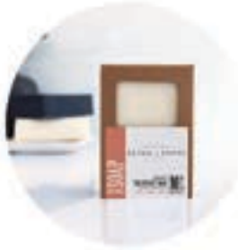
'PERFECT MAN'* (CITRUS+JASMINE+ WOODS)