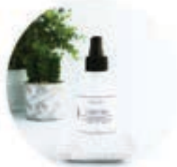
CHRISTMAS HOLIDAY COLLECTION 34115