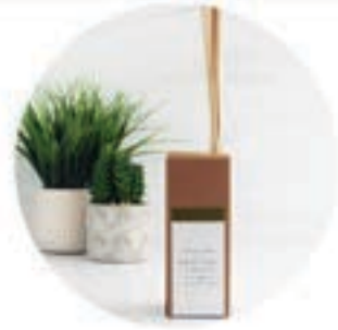
WHITE OAK+VANILLA 33113