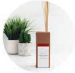
CHRISTMAS HOLIDAY COLLECTION 33115