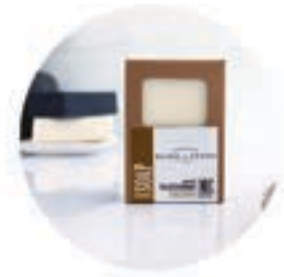
'OUTDOORSMAN'* (CARIBBEAN TEAKWOOD)