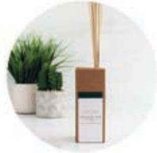
FRASER FIR HOLIDAY COLLECTION 33114