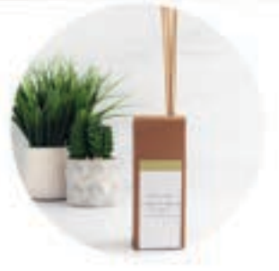
VANILLA BEAN 33111