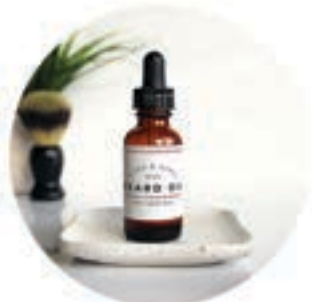
'SELF-MADE MAN' (CITRUS+CEDARWOOD)