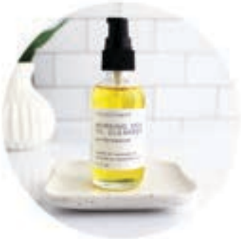
MORNING DEW OIL CLEANSER $11.50* | 2 OZ.