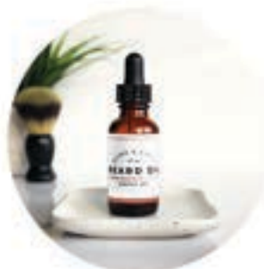
'PERFECT MAN'* (CITRUS+JASMINE+WOODS)