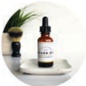
'RUGGEDLY HANDSOME MAN' (OAKMOSS+AMBER)