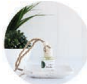
FRASER FIR HOLIDAY COLLECTION