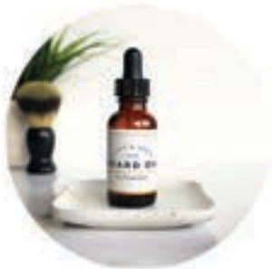
'OUTDOORSMAN'* (CARIBBEAN TEAKWOOD)

Beards need love too . . . am I right? Our high quality 5-oil blend is lightweight, not greasy and glides on easily with no residue buildup. Beards are left smooth, lustrous, and manageable; skin moisturized and conditioned. (1 oz.)