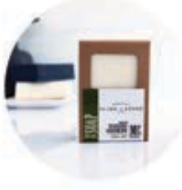
'RUGGEDLY HANDSOME MAN' (OAKMOSS+AMBER)