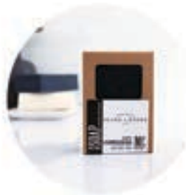
'HARDWORKING MAN'* (AMBER+PLUM+VANILLA)