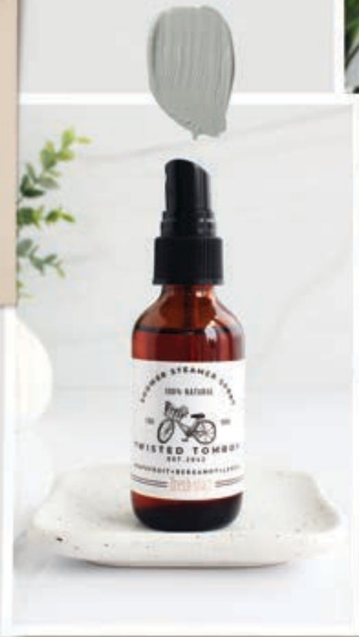
SHOWER STEAMER SPRAY

100% essential oil blend - no fillers! Spray 1-2 pumps into the steam of the shower and enjoy! (2 oz.)